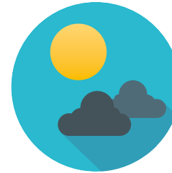
Keeping carers well