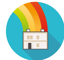
Being here for carers

“The Carers’ Centre are brilliant. You’ve always helped us whenever we’ve had any questions.”