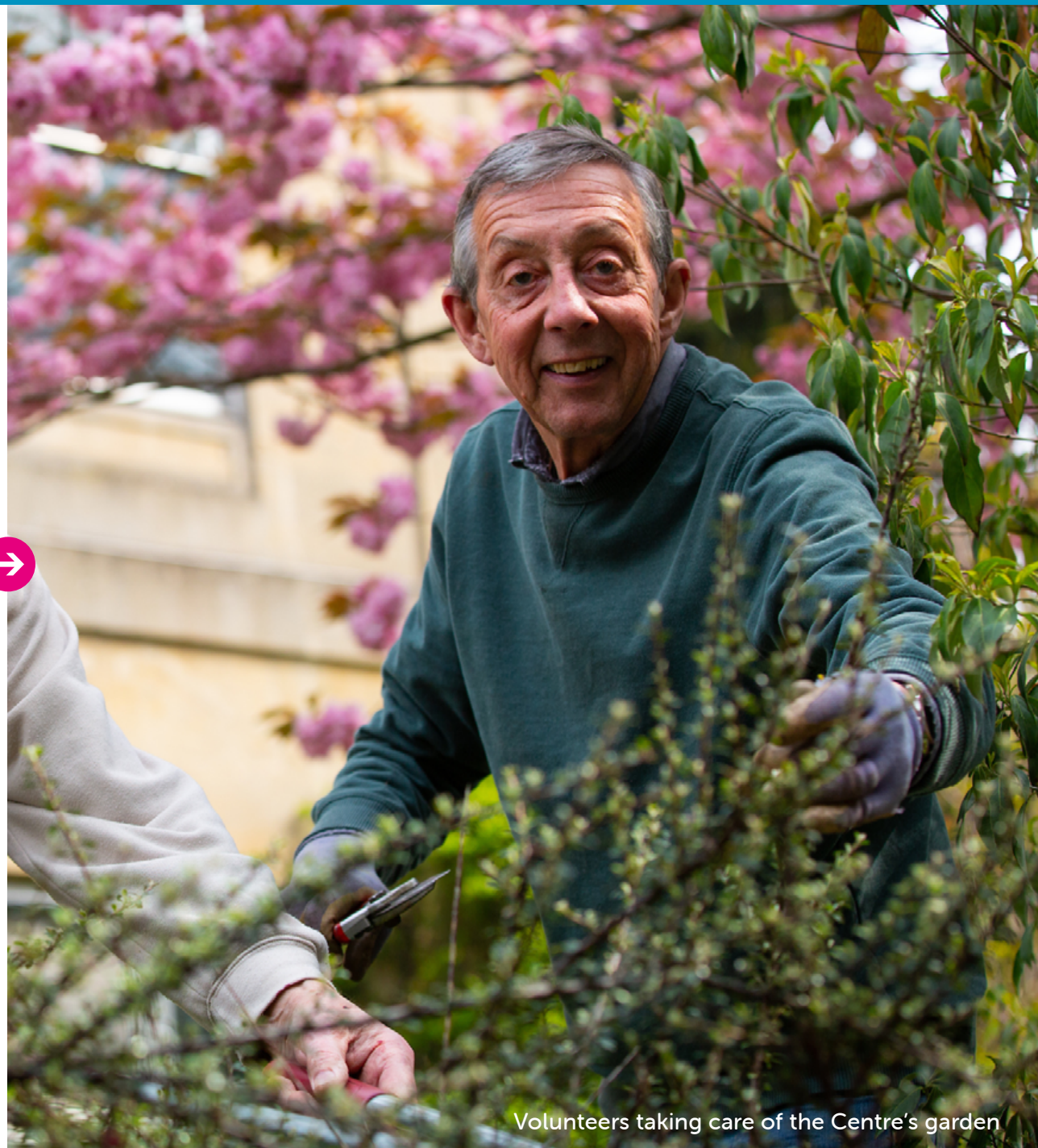
Volunteers taking care of the Centre's garden