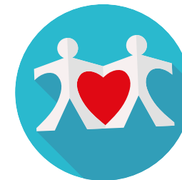
Creating a carer-friendly community