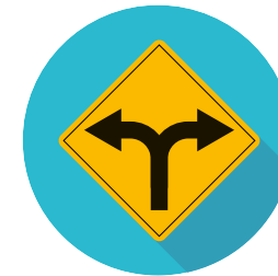
Keeping carers feeling in control