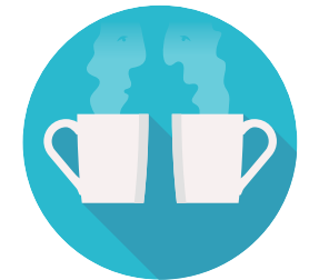
Keeping carers connected