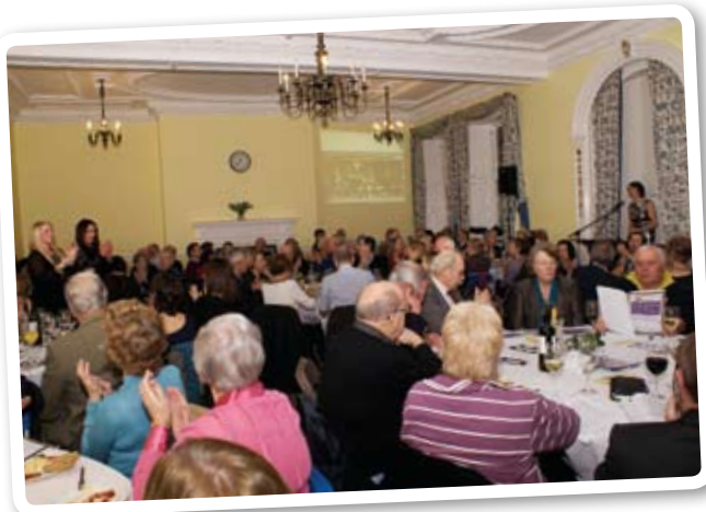
Generous bidders at the Grand Charity Auction.

The Development and Outreach with Carers with Learning Difficulties Project was funded through the ITV Development Grant administered by the Princess Royal Trust for Carers with additional funds given by Quartet Express FM Grant.